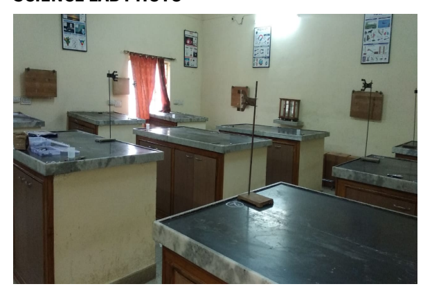
PHYSICS LAB PHOTO